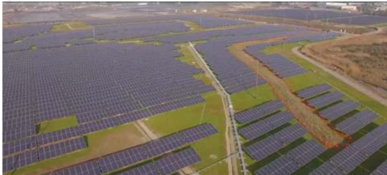
MCE Solar One, a new 60-acre, 10.5 MW solar farm in Richmond.